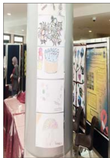
A photo from the event.