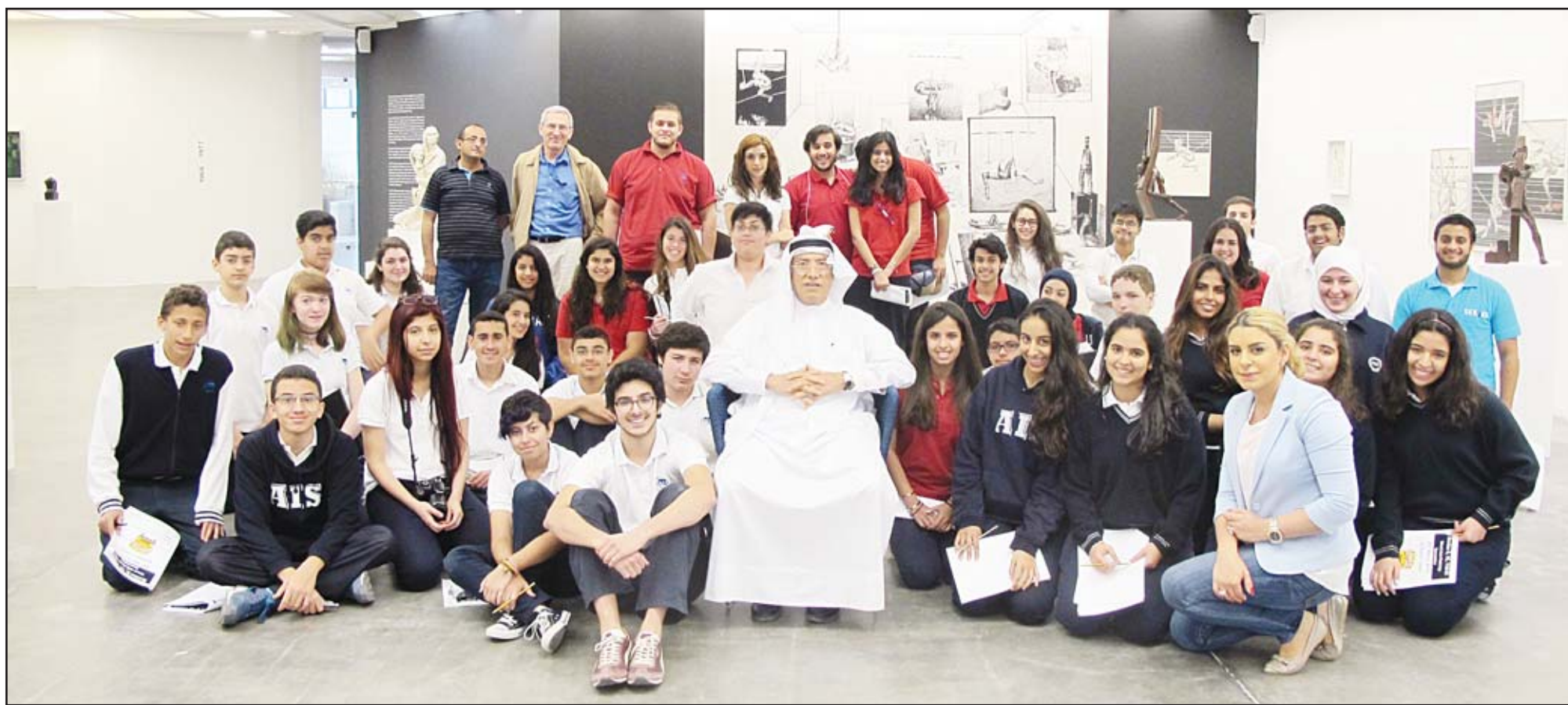
A photo from the event.

The American University of Kuwait (AUK) is an independent, private, equal opportunity, and co-educational liberal arts institution of higher education. The educational, cultural and administrative structure, methods and standards of AUK are based on the American model of higher learning. The language of instruction is English. More information on the American University of Kuwait can be found at www.auk.edu.kw